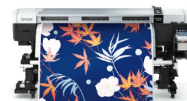
SC-F7270 64" Wide Roll-to-Roll Dye-Sub