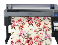
SC-F6330 44" Wide Dye-Sub